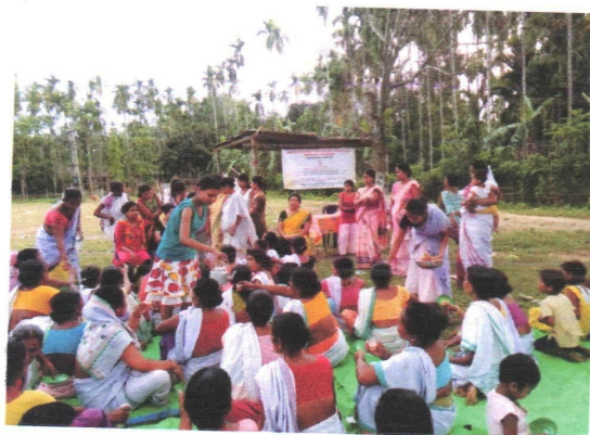
SPEAKERS DELIVERING SPEECH ON THE OBJECTIVES OF SFURTI TO THE PARTICIPANTS