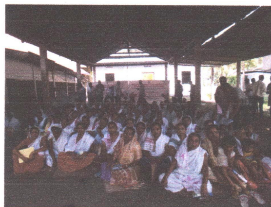
Awareness Generation, Sensitization and Community Mobilization Programmes at Mirza District