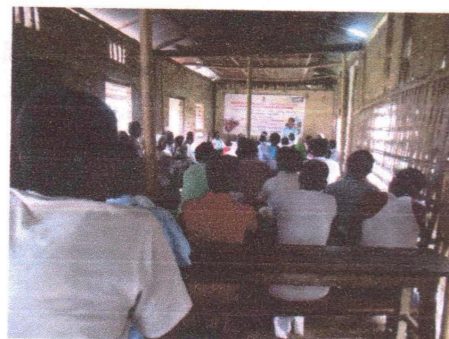
Awareness Generation, Sensitization And Community Mobilization Programmes at Golaghat District